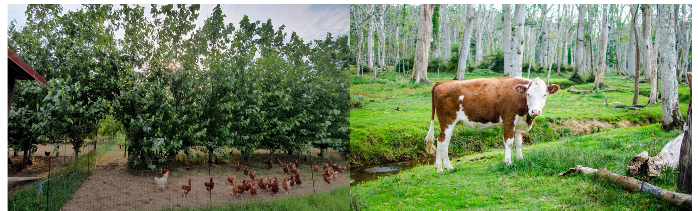
[1] Energy wood production with chicken

Agroforestry systems have a high potential to reduce negative environmental impacts of agriculture. Specific positive environmental effects of agroforestry were confirmed by Torralba et al. (2016), Alam et al. (2014) and Hart et al. (2017), among others. They showed that agroforestry systems have a positive effect on soil protection (reduction of erosion and vitalisation of soil life), water protection (higher nutrient efficiency, reduction of nutrient losses, water retention and irrigation requirements), biodiversity (increase in habitat diversity), and climate change (carbon sequestration). In order to support the transformation of Swiss agriculture from a linear system into a more circular system, the project aims in a next step to implement specific agroforestry adaptations of farming practice in partnering farms.