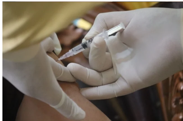
To mandate or not to mandate, that is the question being raised in Switzerland about Covid vaccines.

The issue of a vaccine mandate in Switzerland is not new and is becoming particularly relevant as the epidemiological situation in the country is deteriorating. Could the government decide to take this drastic step after all, and under what circumstances?